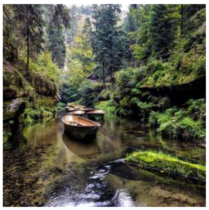
QuickTabs - Zážitek - affiliate

Ultimate hiking experience in the wilderness of Bohemian Switzerland